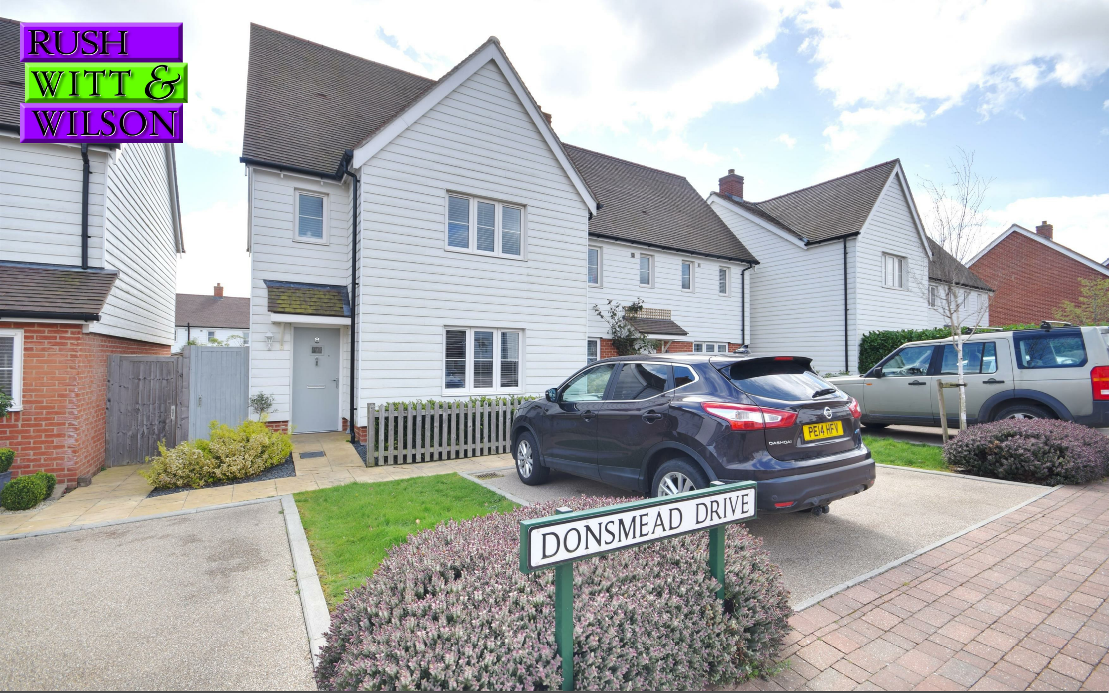
8 Donsmead Drive, Northiam, East Sussex, TN31 6EQ. £355,000 Guide Price